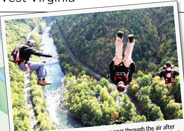
At last year's Bridge Day, BASE jumpers soar through the air after leaping off the New River Gorge Bridge , which spans 3,030 feet.

Road Trip maps are available at www.washingtonpost.com/roadtrip , as are addresses and hours of operation. (Be sure to check before you go.) Have an idea for a trip? E-mail roadtrip@washpost.com .